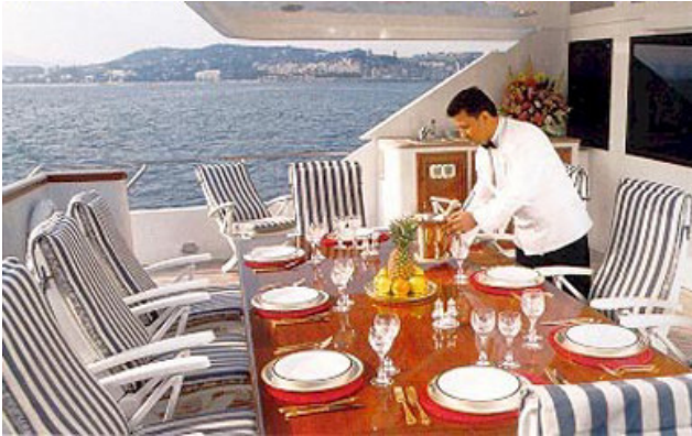
Aft deck table