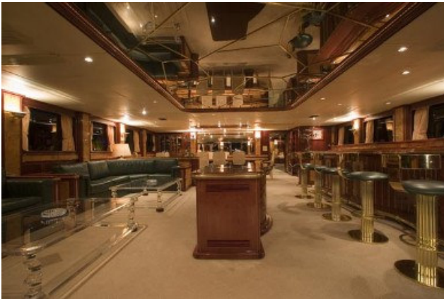
Saloon & Bar