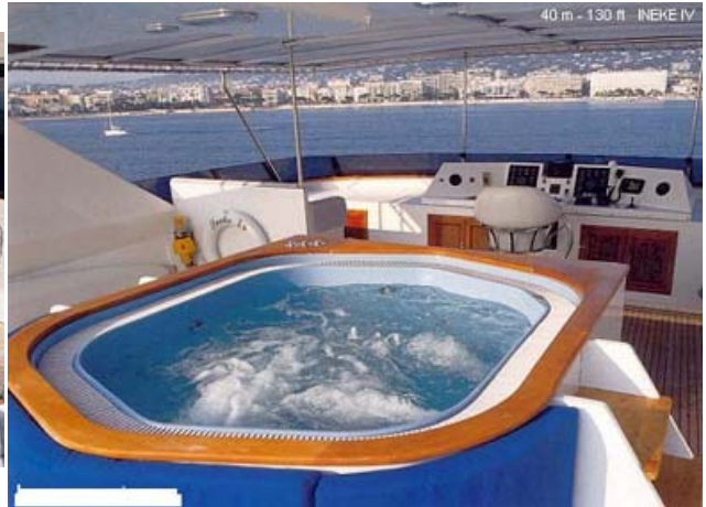
Jacuzzi upper deck