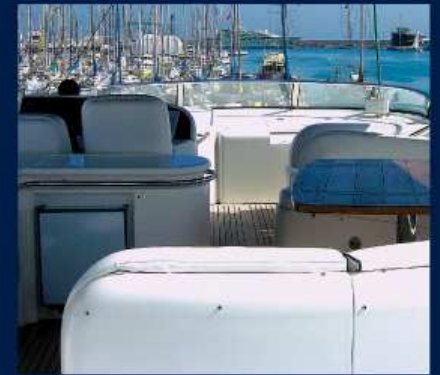
THE FLYBRIDGE: The flybridge is the perfect spot for viewing the dolphins riding the bow. The spacious seating area is ideal for al fresco dining.