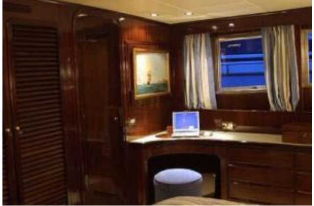
Master cabin - desk area