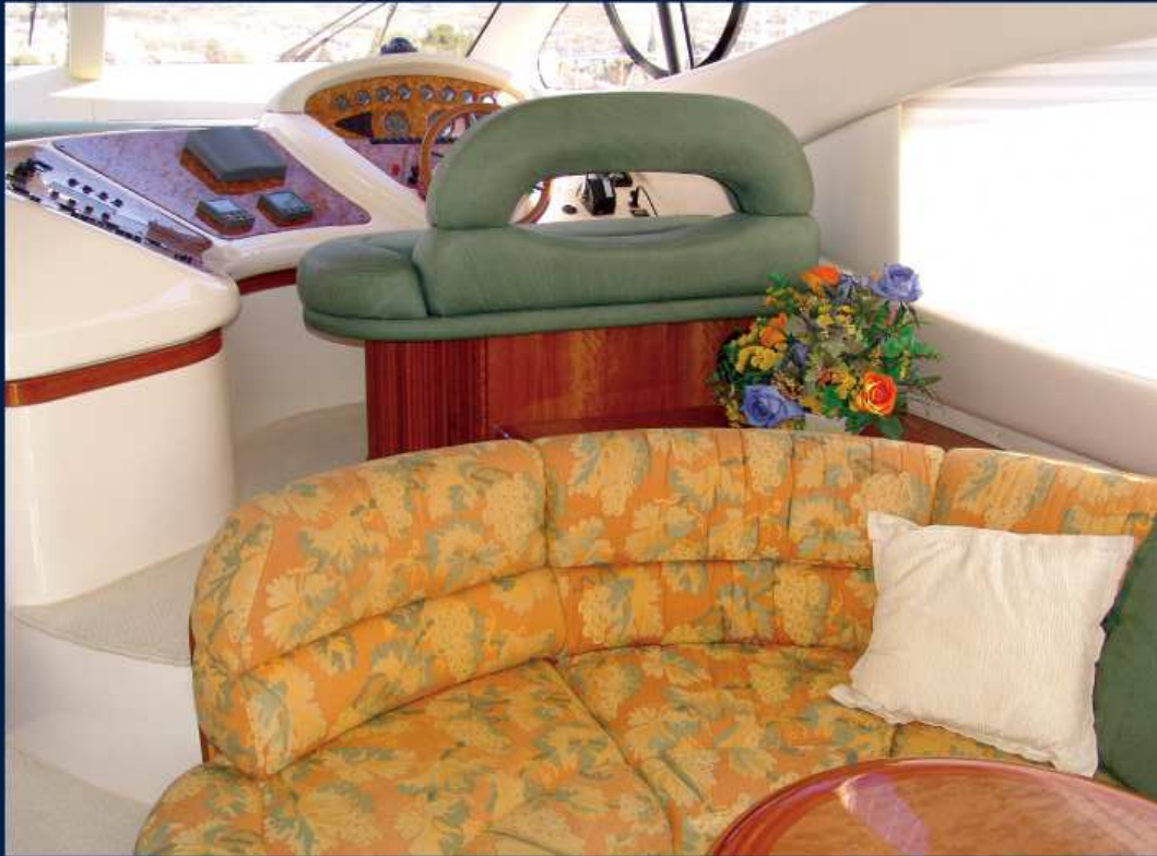
SALON: The elegance and harmony of design is amazing. Every detail has been designed and built to offer clients a unique cruising experience.