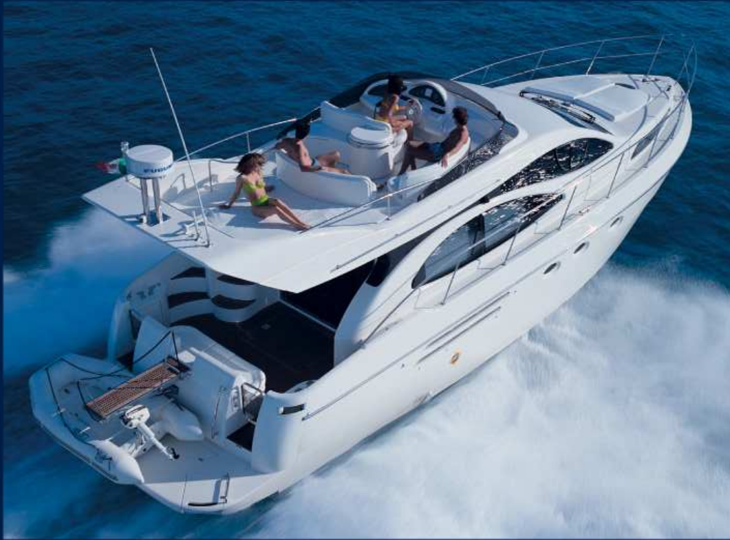
STYLE: Azimut 46 is a master piece of design, markedly different in appearance and features than most yachts. Banana is a yacht where your guests are treated like true VIP's.