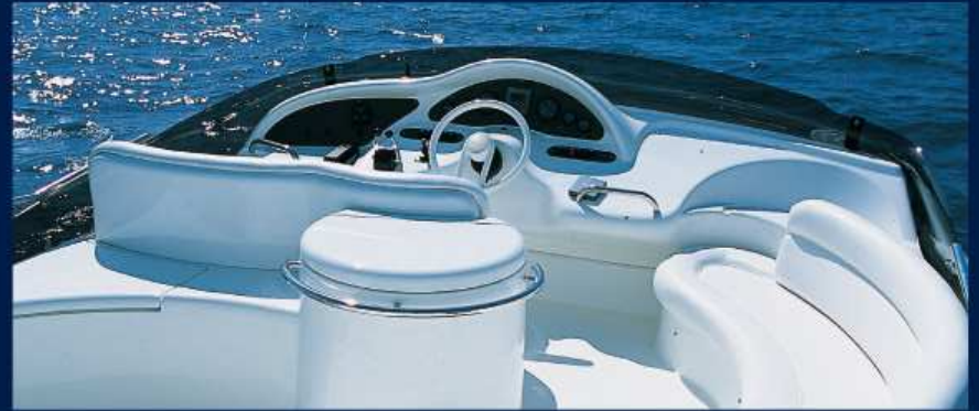
FLYBRIDGE: This elegant cruiser is designed to deliver a lifetime of pleasure. It is a statement in elegant living, impressing all who come aboard.